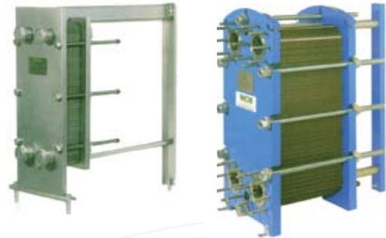
Plate and Frame, Shell and Tube Heat Exchangers, Braze Heat Exchangers, Refurbished Services